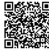
Isle of Palms Retreat registration

Registering online for the 2025 Convention Coming soon!