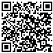
Fabric kit shipping cost donation

Registering online for the 2025 Convention Coming soon!